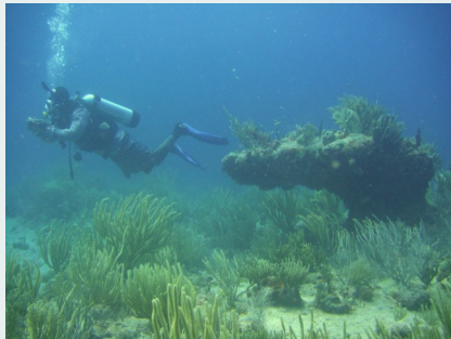
Exploring Anguilla's underwater world can be a very rewarding experience. To be permitted to dive in Anguilla's Marine Parks you must be accompanied by local dive operator.

Phone: 264-497-2871/264-497-8705 Fax: 264-497-8567 E-mail: fisheriesmr@gov.ai